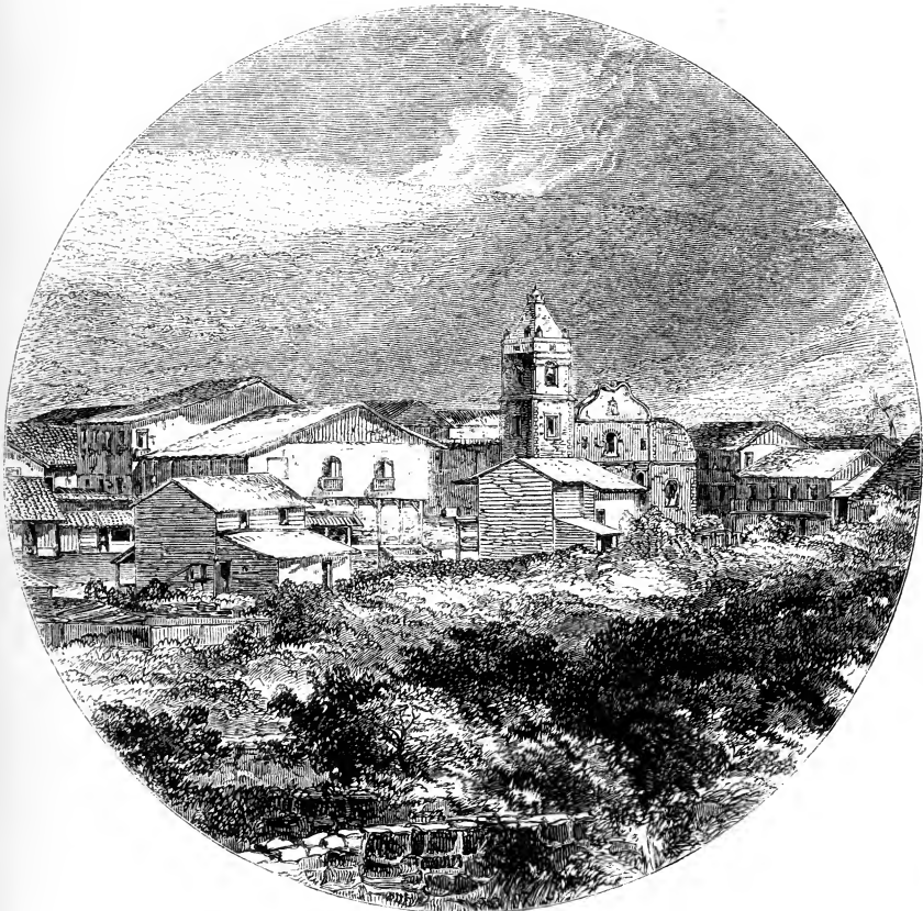
WESTERN SUBURB (SANTA ANA) OF PANAMA.